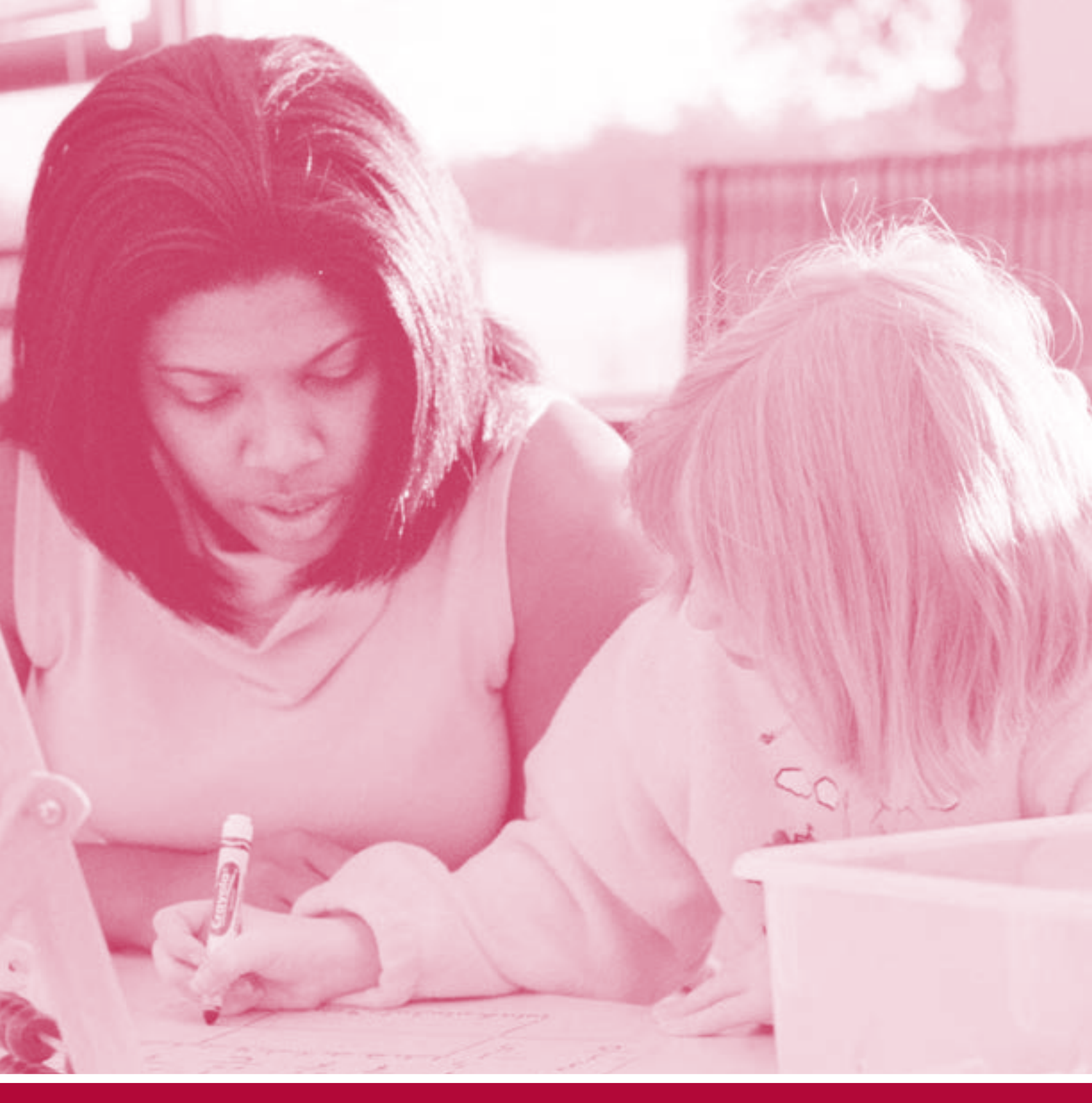
Element 9: Governance