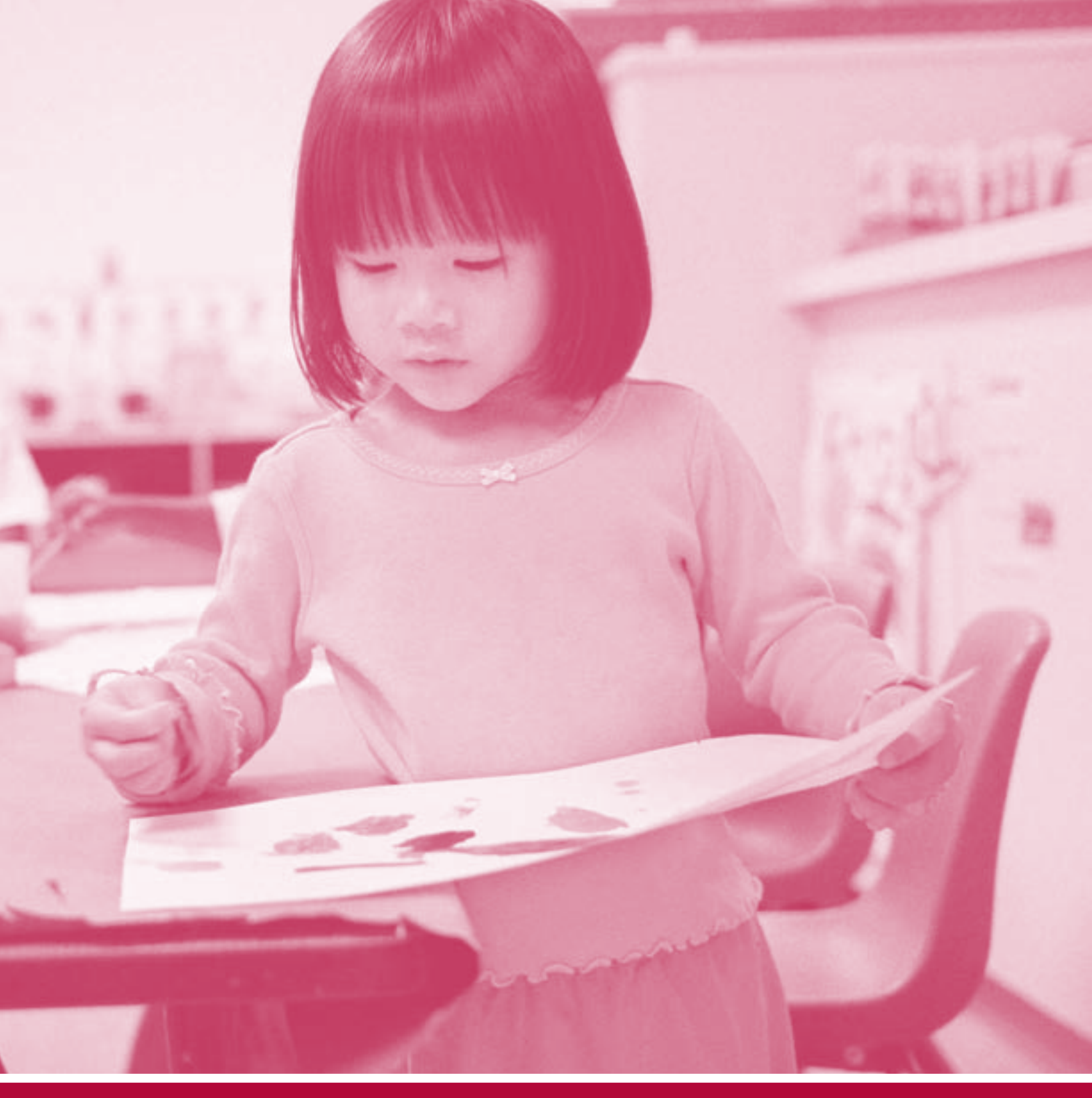
Element 6: Public Awareness