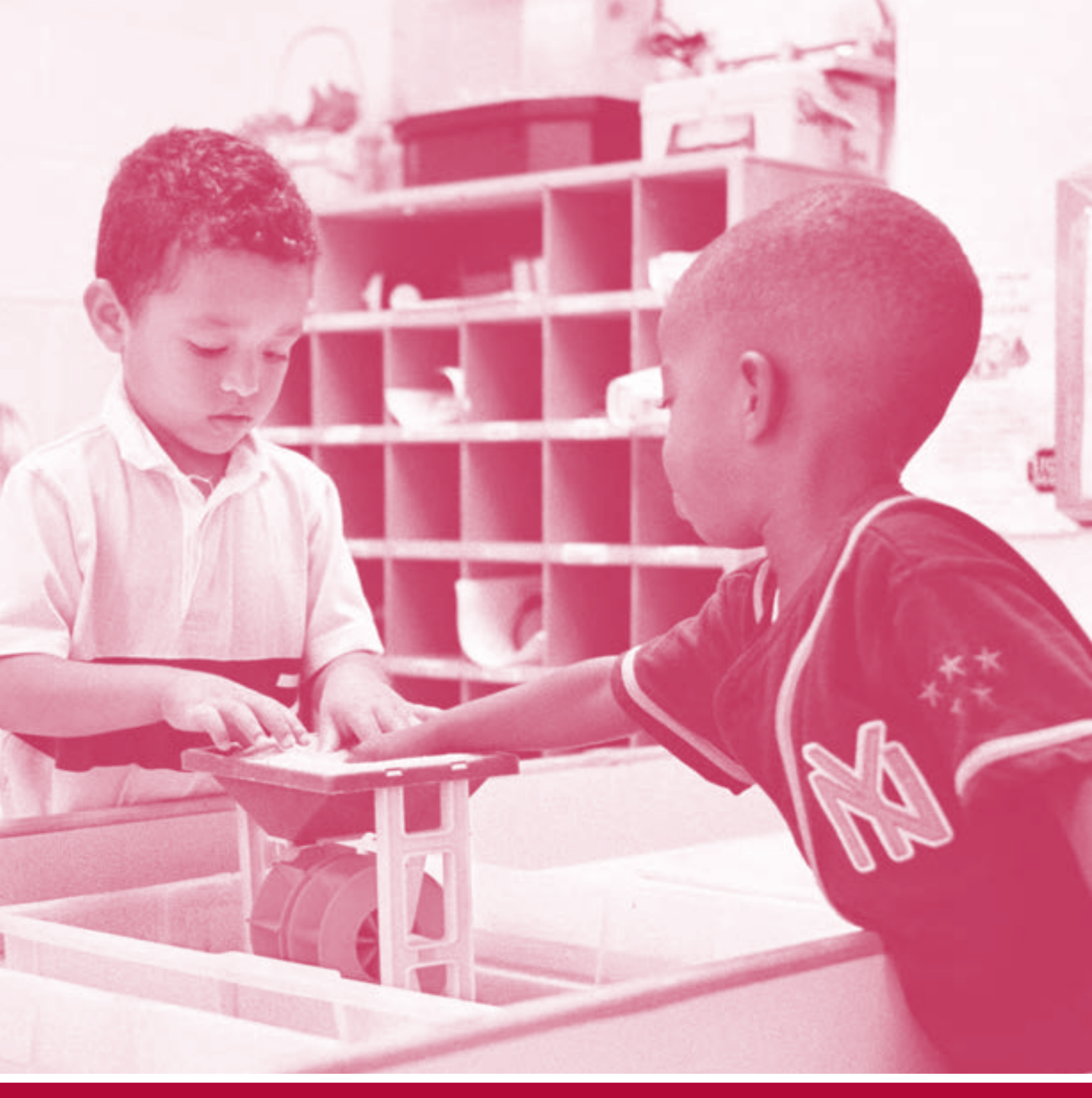
Element 8: Administration