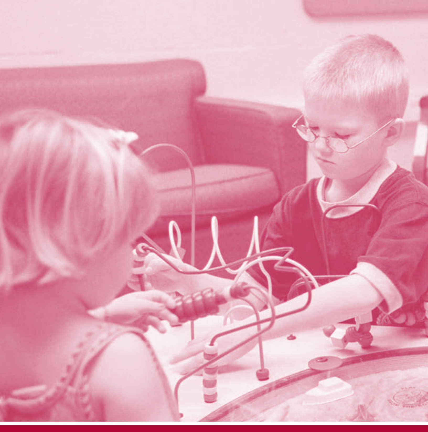
Element 2: Stakeholder Relationships