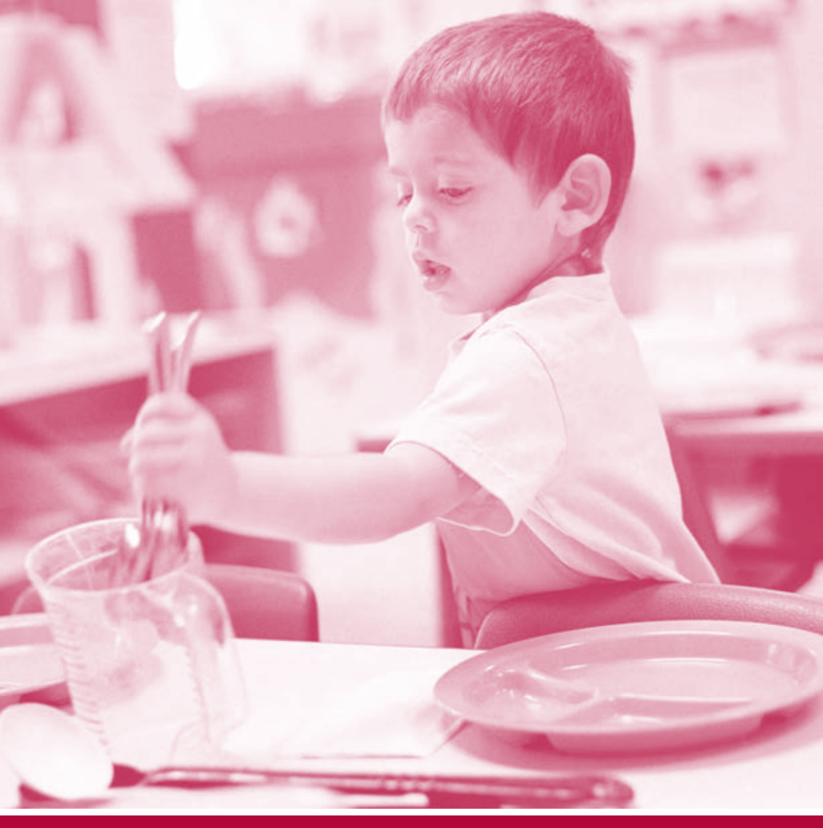
Element 3: Data Analysis and Reporting