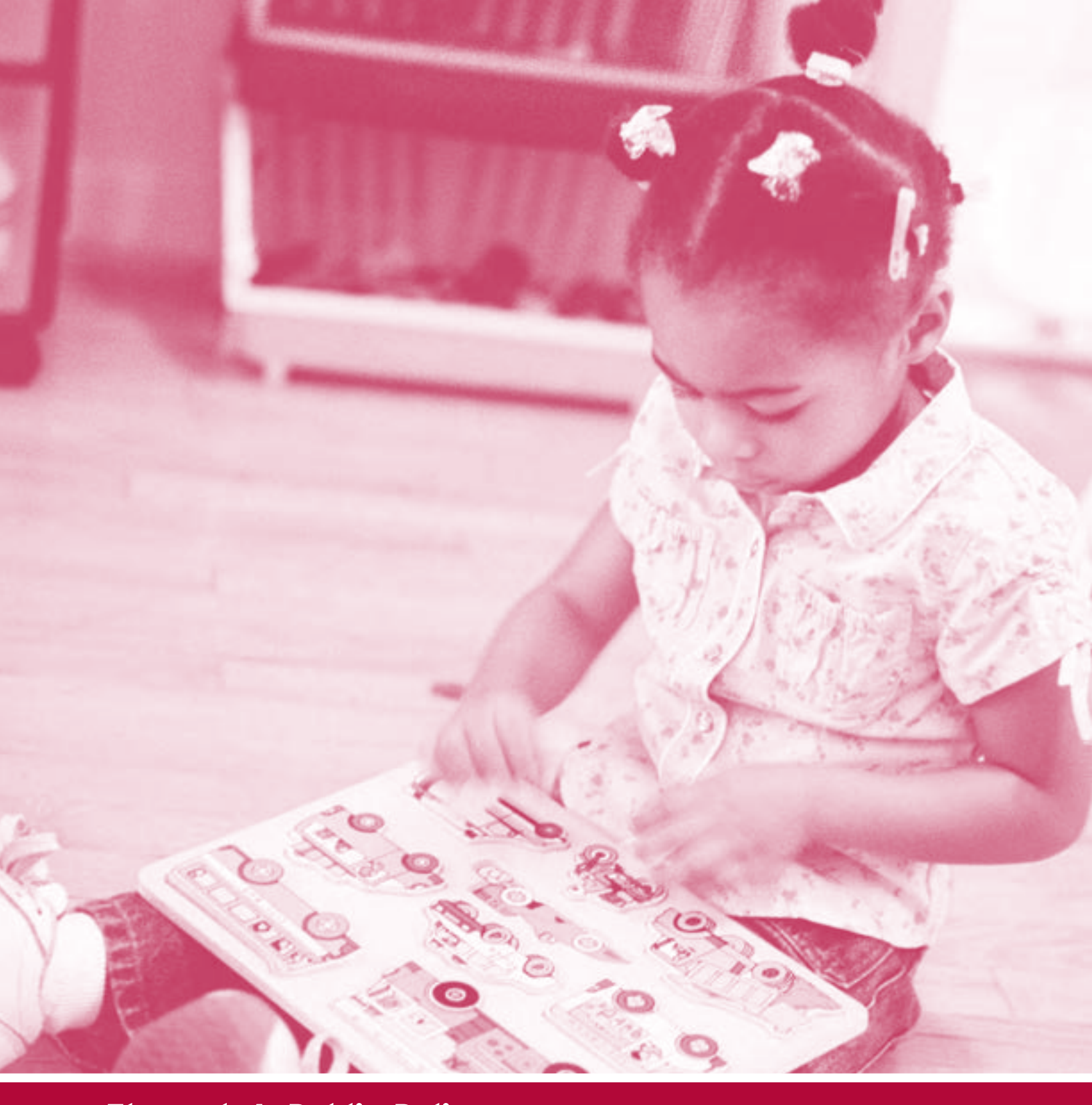
Element 4: Public Policy