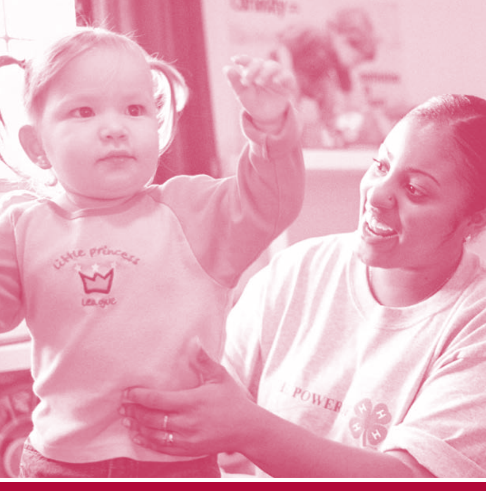
Element 1: Services for Local CCR&Rs