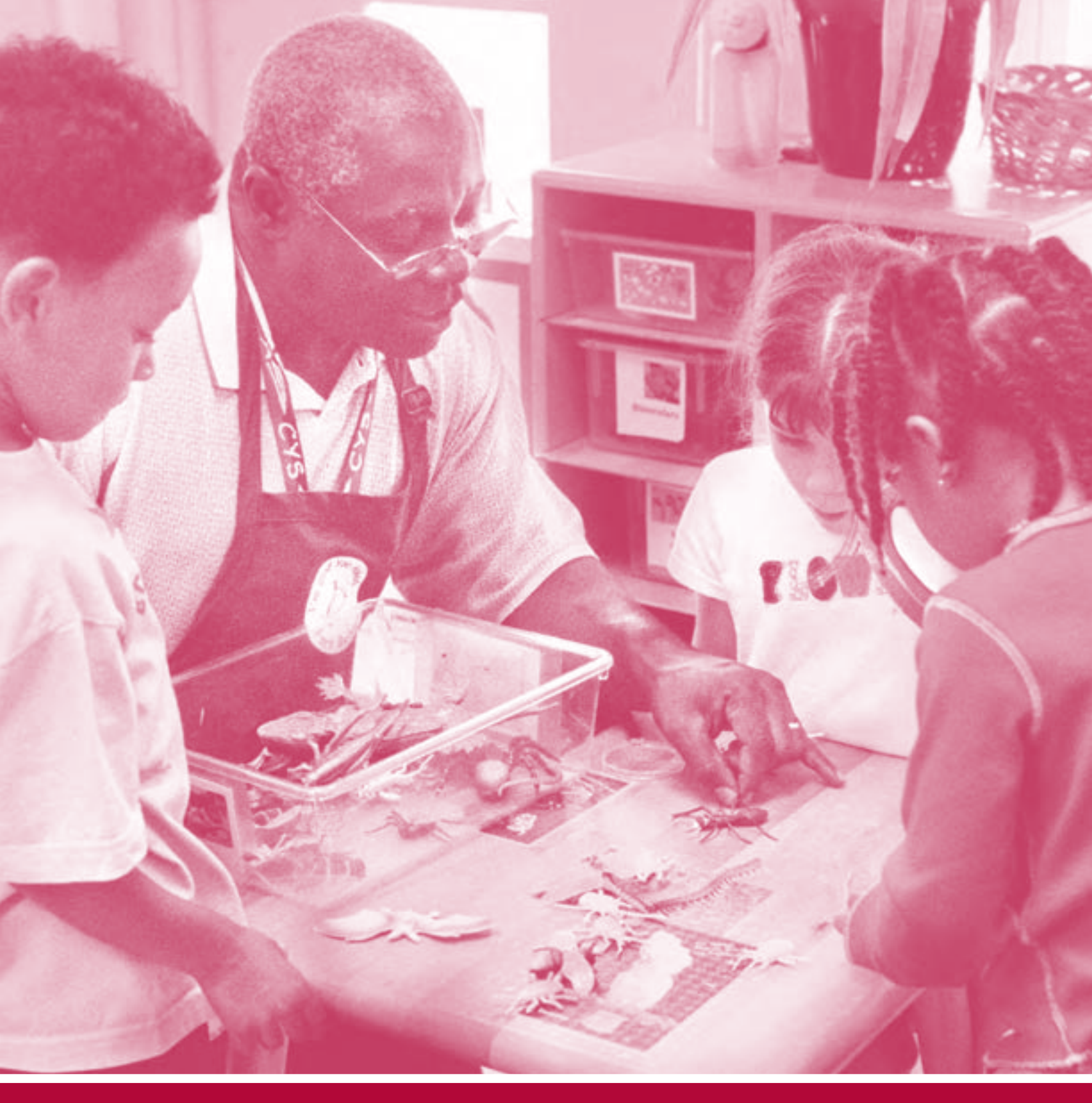
Element 7: Strengthening and Supporting CCR&R Through Direct Services